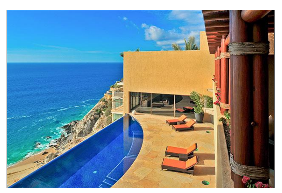
host 150 people for the ceremony and reception. From $3,168 per night.

house is located smack on the Cabo del Sol golf course. From $4,200 per night.